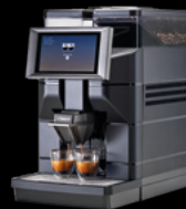
Magic B2 / B2+