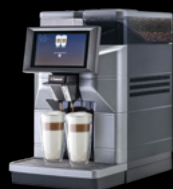
Magic M2 / M2+